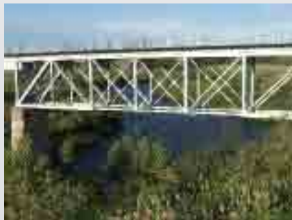
Breathtaking View of Fall River Trestle Bridge